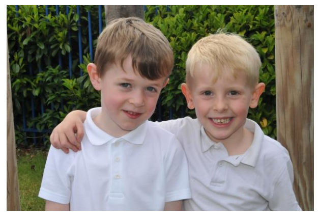
Early Years Prospectus